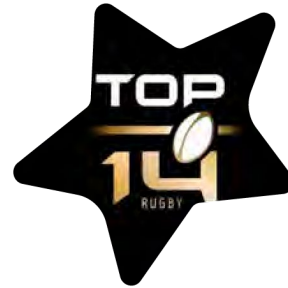
Final TOP 14